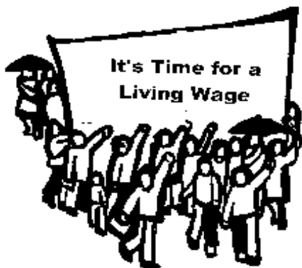
art by Rini Templeton

“It's Time for a Living Wage” 3rd Sunday of each month 7:30 p.m. to 8 p.m. Cable Channel 29